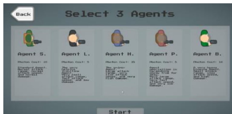
Figure 4. Select Agents Interface

The first thing GameManager does is determine if the player has chosen an agent from the Agent Selection Menu or not (Figure 3). GameManager will replace the default Agent selection with the player-selected Agent if a player has chosen an Agent (Figure 4). Then, based on each Agent that will be played, GameManager will create a new object from the AgentUI class. These items will be displayed as options on the Dashboard so that the player can drag them to spawn Agents.