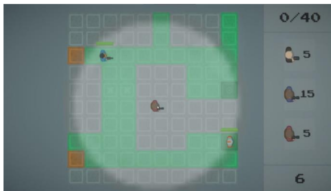
Figure 5. Player Spawn an Agent

drop method of spawning Agents. A distinct Agent is depicted by each generated AgentUI. OnBeginDrag(), OnDrag(), and OnEndDrag are the three methods that AgentUI uses to handle drag and drop input ().