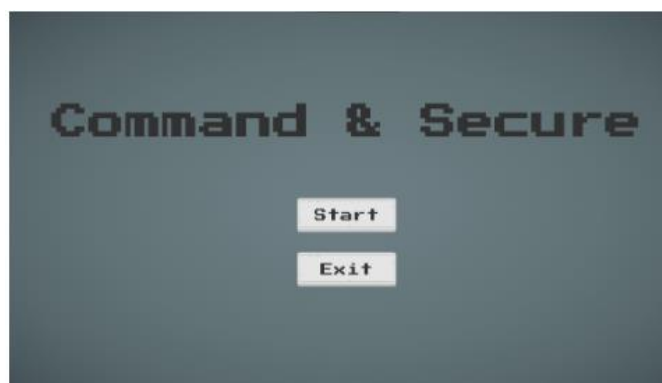
Figure 1. Main interface

There are three different views in the Grid-Based 2D Tower Defense game: The Main Menu, Level Selection, and Gameplay.