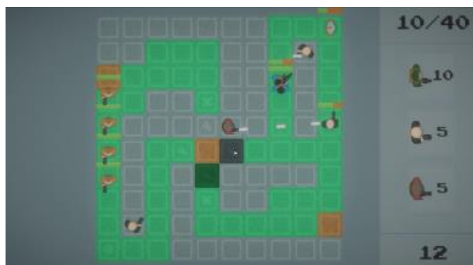
Figure 6. Player Toggle a Door Tile

There are two possible states for each DoorTile: open and closed. In contrast to a closed DoorTile, which is indicated by a gray sprite and isLowground is false, an open DoorTile is indicated by a green sprite and isLowground is true, preventing enemy agents from passing through (Shown in Figure 6). Additionally, every DoorTile has a group id, and multiple DoorTiles can share the same group id. By clicking on the DoorTile, users can make it active. The DoorTile's OnMouseDown() method is called when the tile is clicked. To begin with, this method determines whether or not DoorTile is on cooldown. If not, it will request that GridManager use the ToggleDoorGroup() method to turn on all DoorTiles that share the same group id.