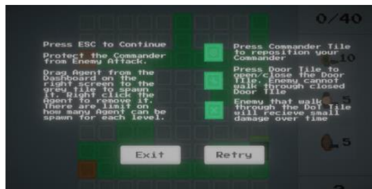
Figure 3. Pause Panel

GameManager will carry out the Start() method execution after the Awake() method has been accomplished. On the Start() method, several operations must be carried out. GameManager must first check to make sure the game has not been paused or ended. The database must then be loaded with information specific to the level that was chosen. The player must then load the Dashboard with all of the Agents they have chosen. The player must then begin the Enemy Counter, which by default starts at 0 and counts both the number of enemies present overall at the level they have chosen and the enemies they have already defeated. The player's initial number of Photons must then be updated based on the level they have chosen, while also updating the Photon counter. In the future, players will occasionally receive Photons. The Pause panel (Figure 3) must be closed by GameManager before proceeding.