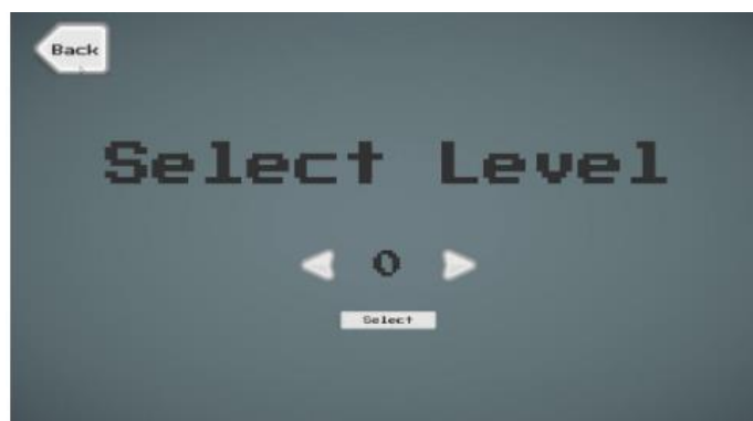
Figure 2. Select Level Interface

Figure 1 depicts the 2D Grid-Based Tower Defense's main interface. Two options are available to the user in the main interface: 1 and 2 are the start and exit buttons. The Exit button is used to end the game, while the Start button initiates it. GameManager first calls the Awake() method after loading the game. Its purpose is to allow GameManager to determine which level the Player has chosen from the Level Selection Menu. When the game is being debugged, if no level is chosen, the system will typically choose level 0, which is the default level. The system loads the Select level interface after the user clicks the Start button (Figure 2). The user can select a level in the Select Level interface. The levels will be generated using the GridManager.