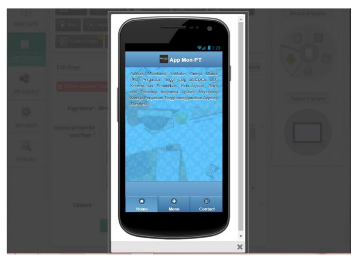
Fig 3. Results of Higher Education Performance Monitoring Applications

"University Performance Monitoring Application" with various color designs and attractive icons. The main menu display consists of the eight KPI menu icons, namely; 1) graduates get decent jobs, 2) students get off-campus experience, 3) lecturers have activities outside of campus, 4) teaching practitioners on campus, 5) lecturers' work is used by the community, 6) study programs work together with class partners world, 7) Collaborative and participatory classes, and 8) international standard study programs. Users can access by pressing the button.