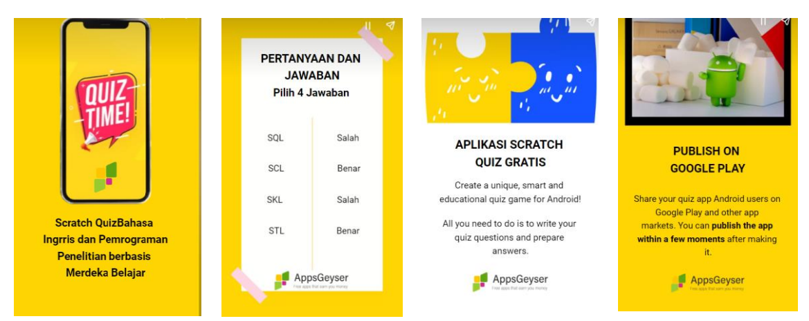
Fig 2. Scratch Quiz Application Display AppsGeyser